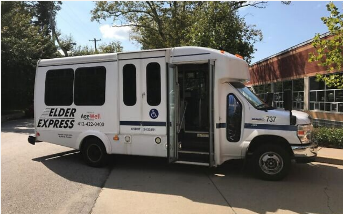
Elder Express vehicle comes to a stop.